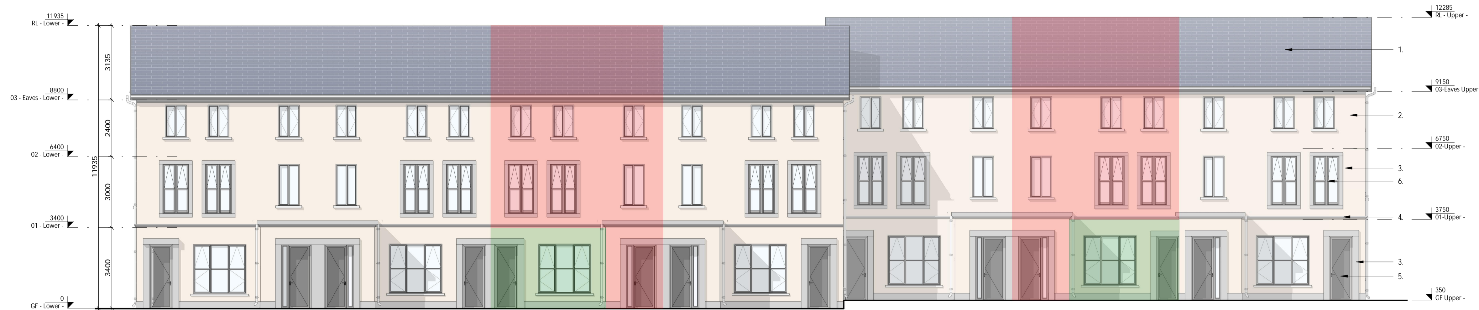
1 Front Elevation 1 : 100