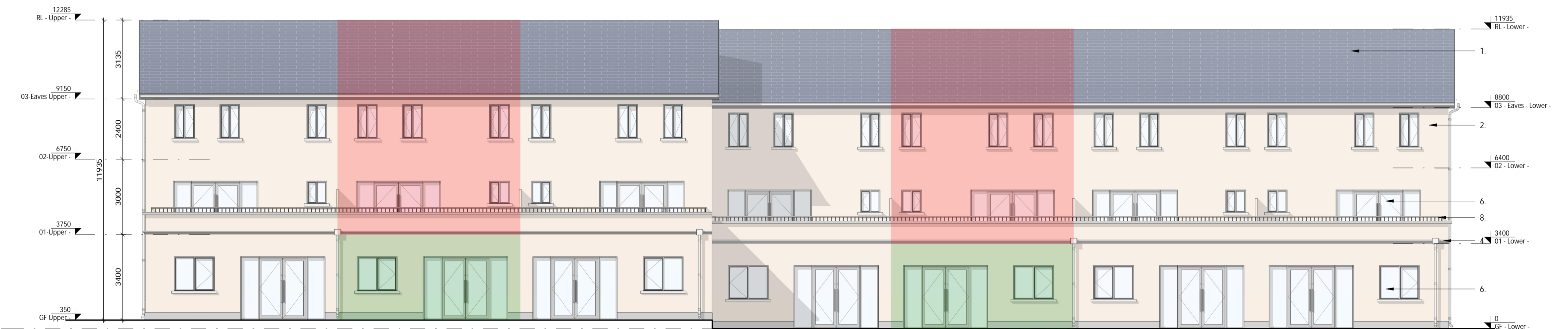
2 Rear Elevation 1 : 100